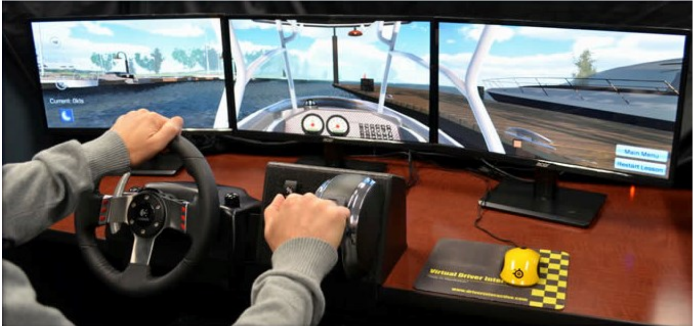
The trainer has three 20" monitors, steering wheel, horn and throttle with trim

Want to test your boating skills when there's no wind, current or seriously expensive craft nearby? Want to see how you execute a pivot turn in high wind and rain? At night? Without getting wet?