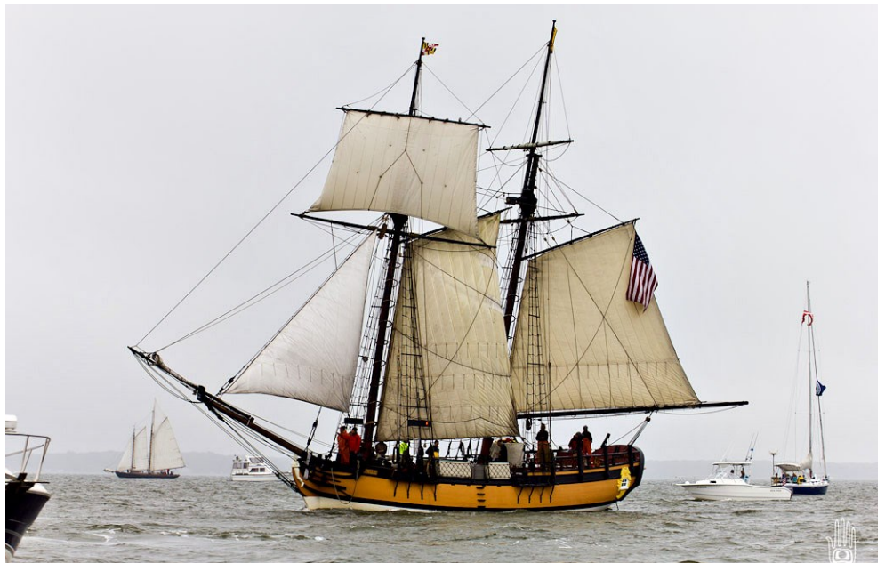
The Sultana, a reproduction of a 1768 schooner used by the British Royal Navy to enforce the hated taxes on tea taxes in colonial America.

The host ship and organization were the Sultana and the Sultana Education Foundation; both are based in Chestertown.